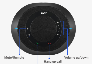
Mute/Unmute Make/Answer call Hang up call Volume up/down Phone input