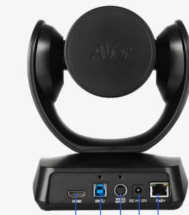
HDMI out USB 3.1 type-B RS232 in/out DC 12V LAN for IP streaming and PoE+