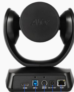
HDMI out USB 3.1 type-B RS232 in/out DC 12V LAN for IP streaming and PoE+